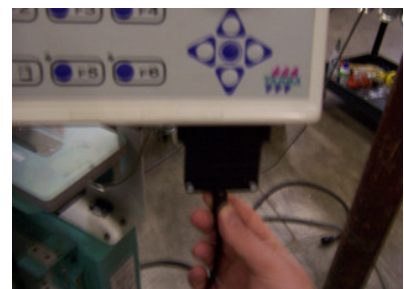
Image 2.B - Plug into Smart Connector