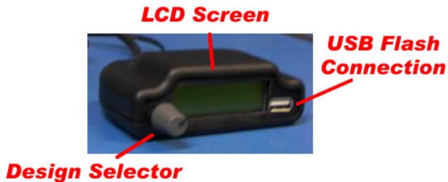
Image 1.A - Front of the USB Reader

Pictures and description of your device and its parts: