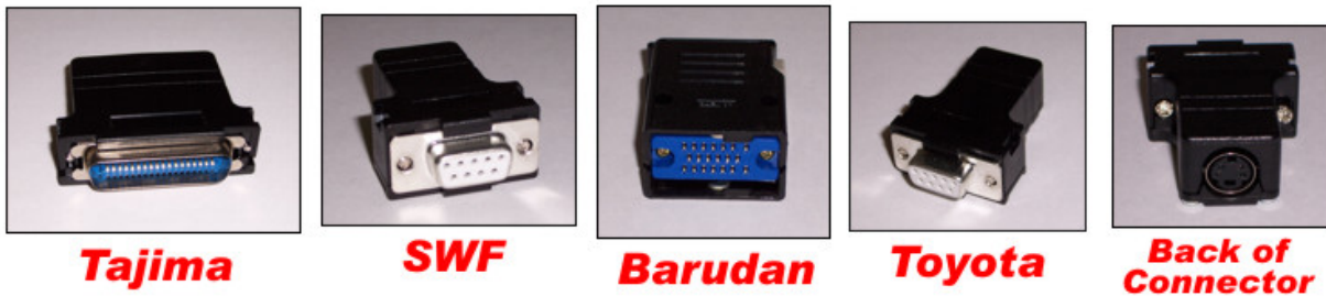
Image 1.C Smart Plugs