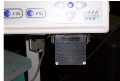
Image 2.A - Connect to Machine