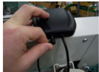
Image 2.C - Connect Power